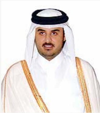
The Heir Apparent, H H Sheikh Tamim bin Hamad Al Thani

The Decision specified the GSDP's roles and responsibilities, amongst which the most significant is the preparation of the strategic development plan for the achievement of the comprehensive development vision in the economic, social and demographic fields and determining the mechanisms necessary for achieving these objectives. This is to be done in consultation with government agencies and by surveying the opinions of the private sector and civil society organizations.